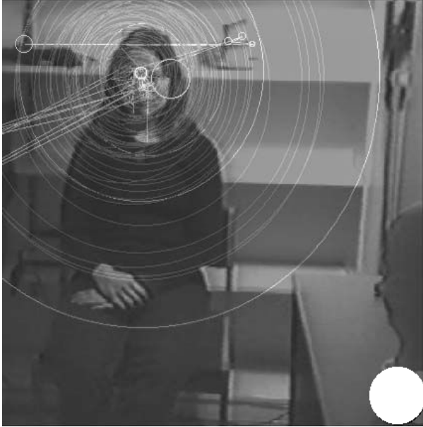
Figure 4. The saccades, fixation locations, and fixation durations of an addressee looking at a speaker. The diameter of the circles indicates the duration of the fixation. The fixation comparison point in the bottom right corner equals one second.