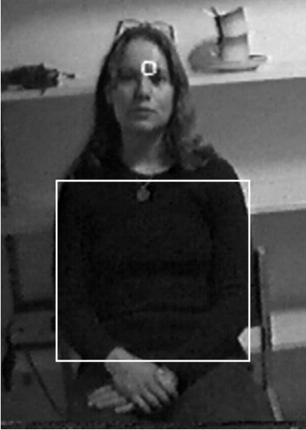
Figure 1. The speaker's central gesture space as a rectangle. Everything outside the rectangle represents the speaker's peripheral gesture space. The addressee's fixation as a white circle at its default location in interaction.